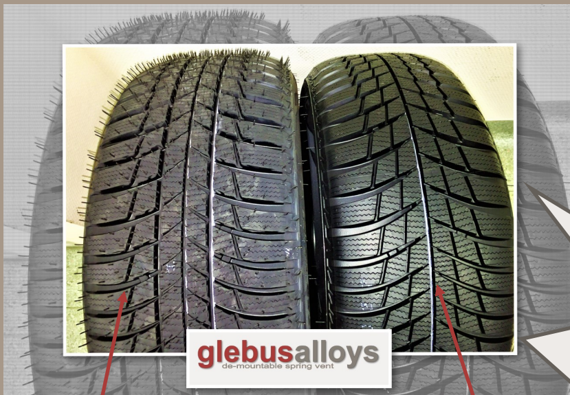
Tire Using Traditional Small Hole Micro Vents